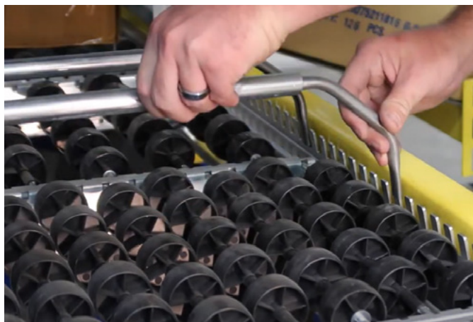
Install on Pick Aisle