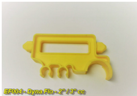
EF004 - Dyna Flo - 2" / 3" cc