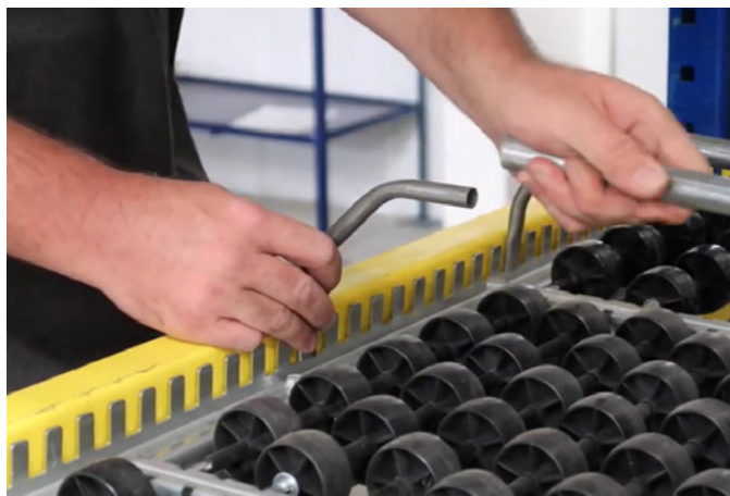
Install on Load Side