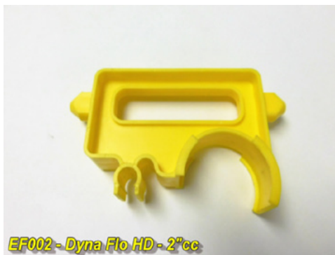
EF002 - Dyna Flo HD - 2"cc