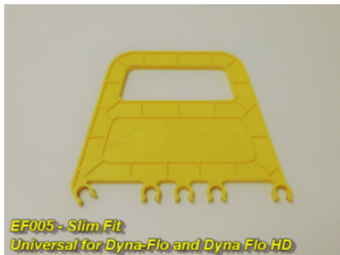
EF005 - Slim Fit Universal for Dyna-Flo and Dyna Flo HD