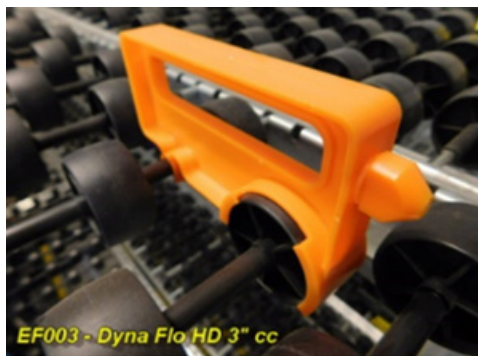
EF003 - Dyna Flo HD 3" cc